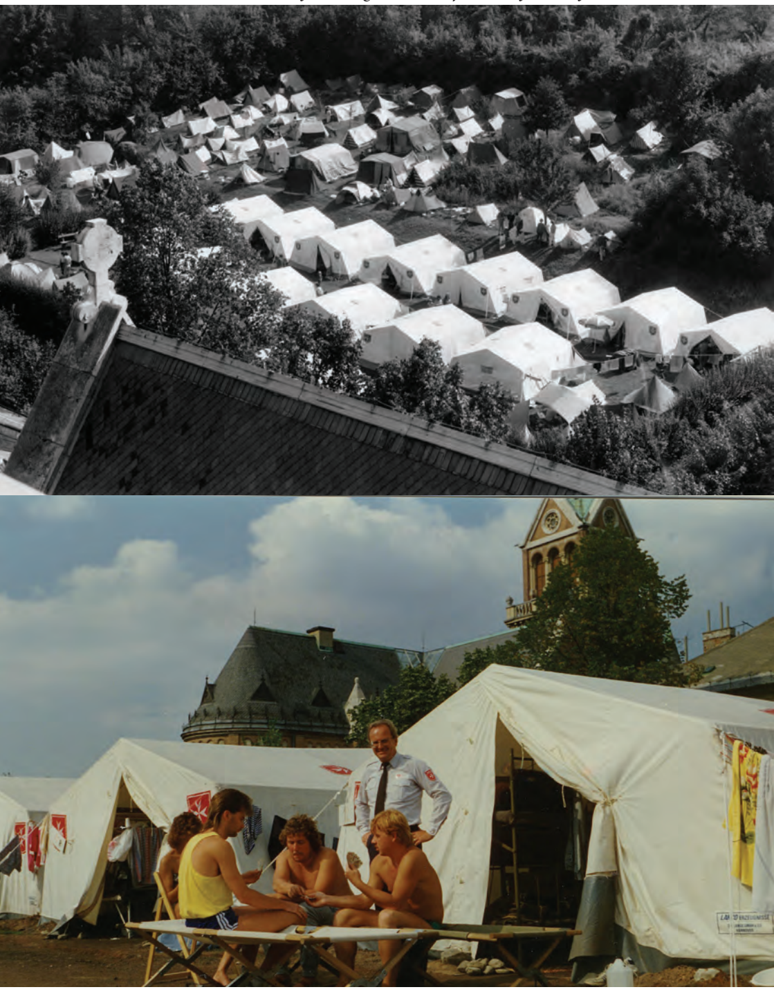
Members and volunteers of the Hungarian Charity Service of Order of Malta...